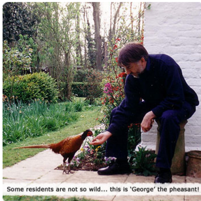
Some residents are not so wild... this is 'George' the pheasant!

This ex-gamekeepers cottage is in a totally unique secluded situation. Renovated in 1997/8, it is situated in the middle of a 100 acre wood with 4 acres of woodland attached to the cottage to roam in. A variety of wildlife visit the area of the property eg. deer, pheasants and of course, many birds including game-birds, owls, nuthatches, woodpeckers and the nightingale in season. There are two ponds, one some distance from the house and the other adjacent (with fencing). The cottage is available all year: the wild coast in the winter is exciting ! We are sure you will find staying in this cottage a unique and enjoyable experience.